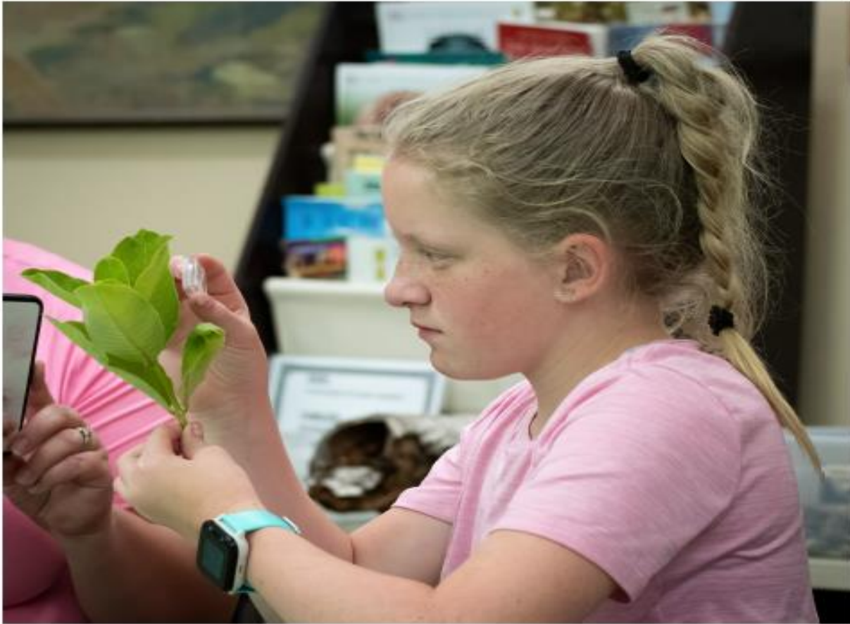
Examining Monarch eggs on milkweed