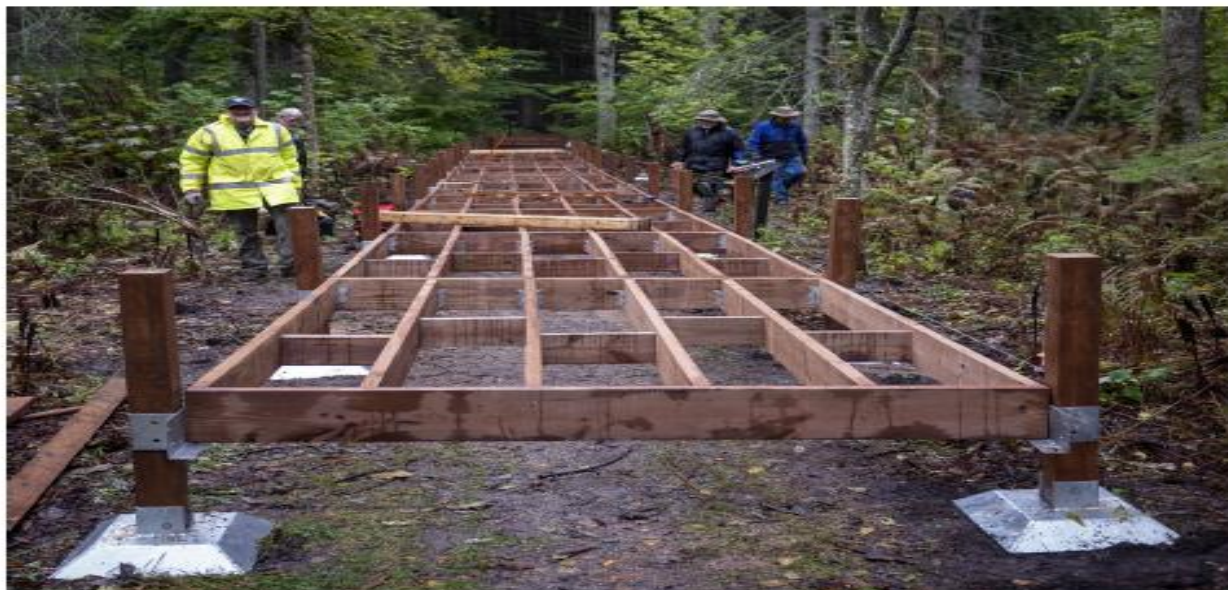
Great progress on the first workday!

Our first workday was Saturday, September 24... a rainy but productive day with more than 20 volunteers coming out to help.