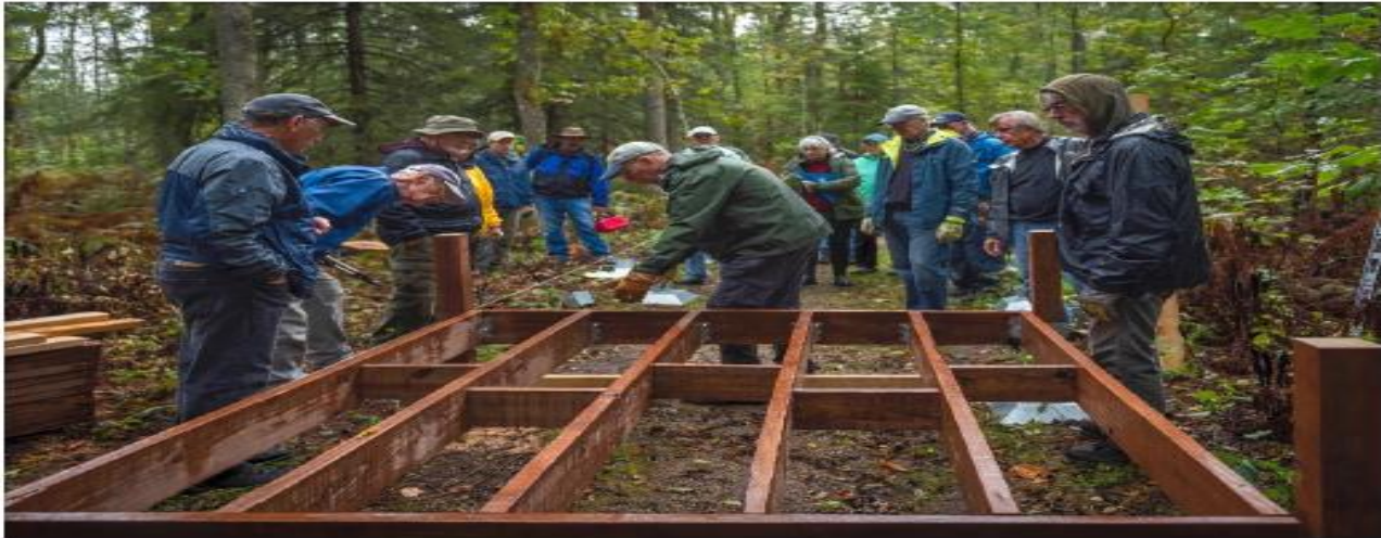
Construction has started on the new elevated Fern Trail boardwalk. See story below.

Published by Newport Wilderness Society The Friends Group of Newport State Park